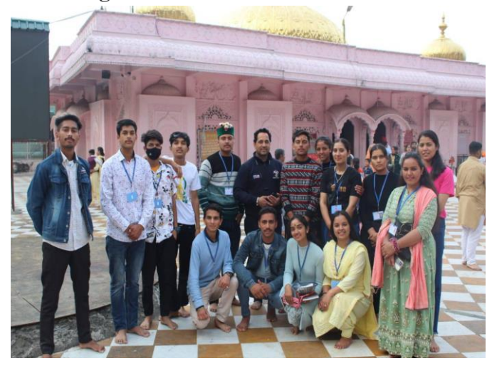
Some Glimpses of Educational Tour