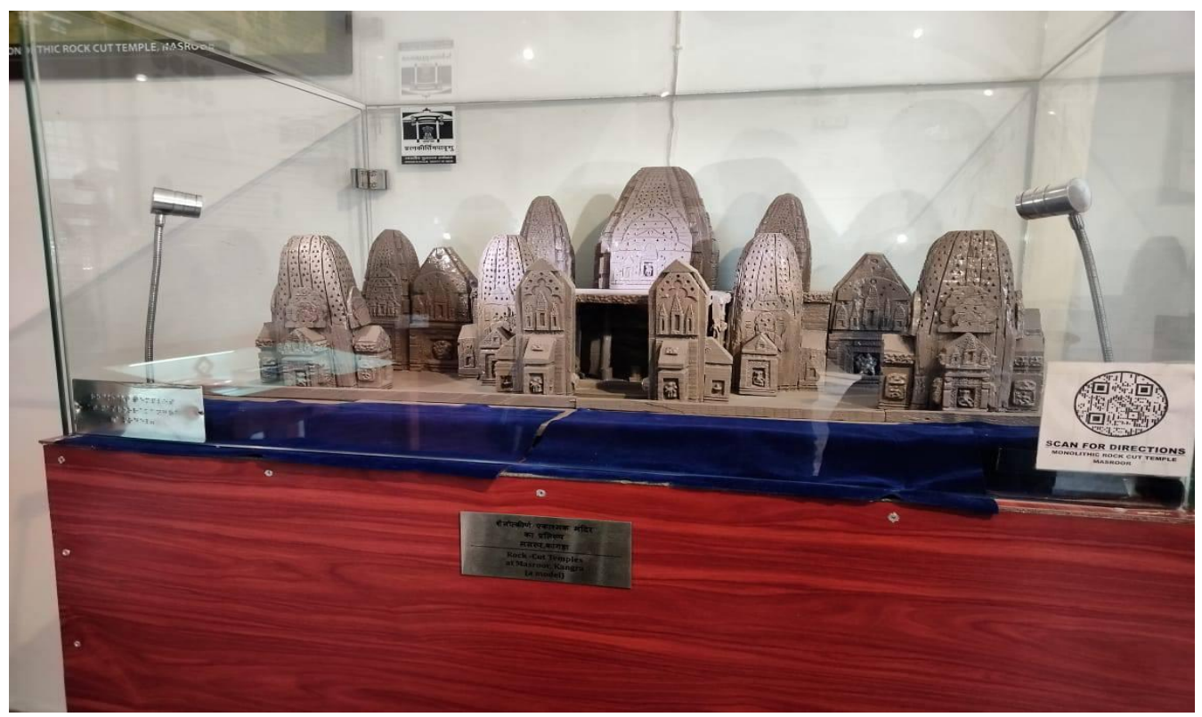
Some Glimpses of Historical Places