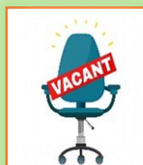
Vacant Assistant Professor Department of Commerce