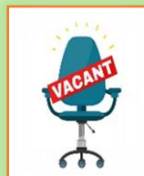
Vacant Assistant Professor Department of Chemistry