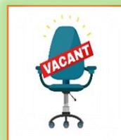
Vacant Assistant Professor Department of Mathematics