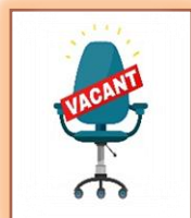
Vacant Assistant Professor Department of Mathematics