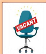
Vacant Assistant Professor Department of Commerce