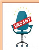
Vacant Assistant Professor Department of Chemistry